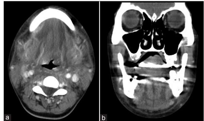
Figure 2: Contrast-enhanced computed tomography of the neck (a) showed diffuse soft-tissue swelling and fatty stranding of the sublingual, submental, and submandibular areas, and the rest of bilateral cervical spaces; (b) swelling of submandibular space resulted in an upper elevation of the tongue and consequently caused pending upper airway obstruction

In the present case, a swollen floor of mouth with a decreased interincisal distance implied trismus, which indicated difficult